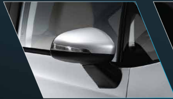
Electric Door Mirrors with Auto Fold Function