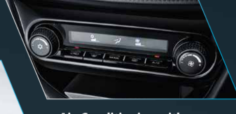
Air-Conditioning with Digital Display