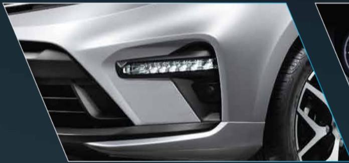
LED Daytime Running Lamps