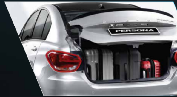
510L Boot Space